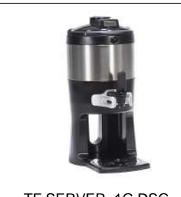
TF SERVER, 1G DSG GEN3