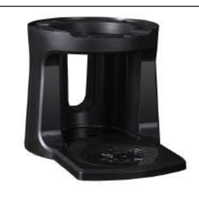
STAND ASSY KIT, TF SERVER