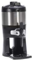
TF SERVER, 1G DSG GEN3