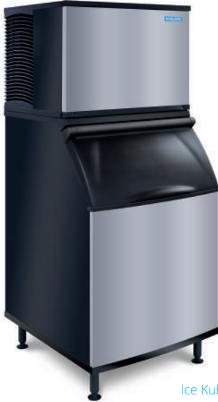
Koolaire KT-0500 Ice Kube Machine on K570 Bin

Koolaire by Manitowoc ice machines are designed, developed and tested by Manitowoc engineers to provide great ice production, energy efficiency and reliable service at an affordable price.