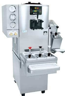
Optional cart with rear door for front mount syrup rail