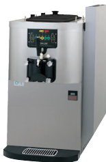
Optional top air discharge chute