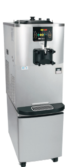
Optional cart with front opening door