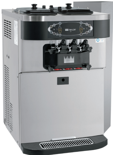
Shown with optional top air discharge chute