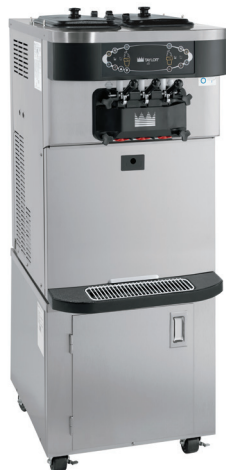
Shown with optional standard height cart