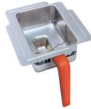
FUNNEL ASSY,SST-PP ORANGE HDL