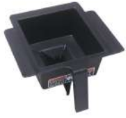
FUNNEL W/DECAL,PPK NAR BLK(SM)