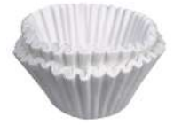
FILTERS,REGULAR1M 500/2 50/CL