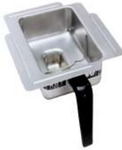
FUNNEL ASSY, SST-PP BLK HDL