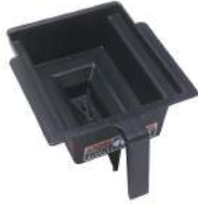
FUNNEL W/DECAL,PPK NAR BLK(LG)