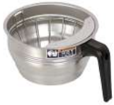
FUNNEL ASSY, SST-BLK HDL(7.12)